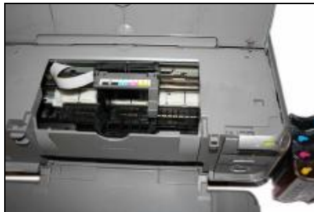
Open the printer cover, move the cartridge Carriage to "cartridge replace position". Take out the original cartridges