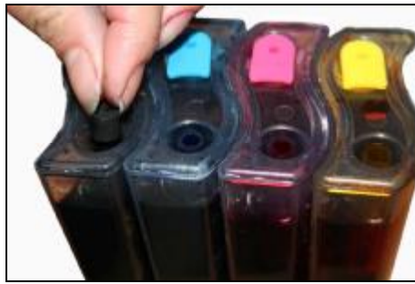
Pull out the small rubber plug from the air hole as picture shown above.