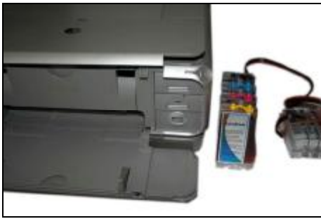
Put the CISS on the left side of the printer and place all the tubes at correct position.