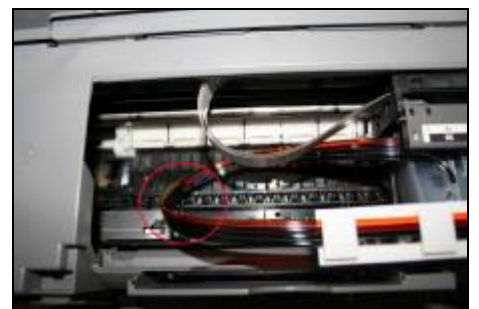
Move the cartridge car to both sides. Make sure that the tubes are not too tight or too loose.