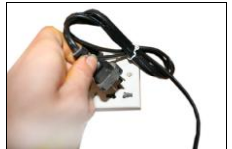
Turn off the printer and unplug it.