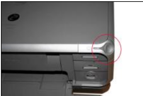
Turn on power.