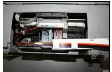
Remove the bottom cap from CISS cartridges. Place them into cartridge carriage carefully. Fix the support arm, which should be 4 cm from the right edge of printer, place the tube through supporting arm as the picture shown above.