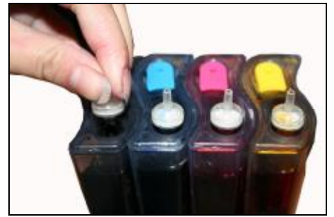
Place 4pcs of air filters into air holes,